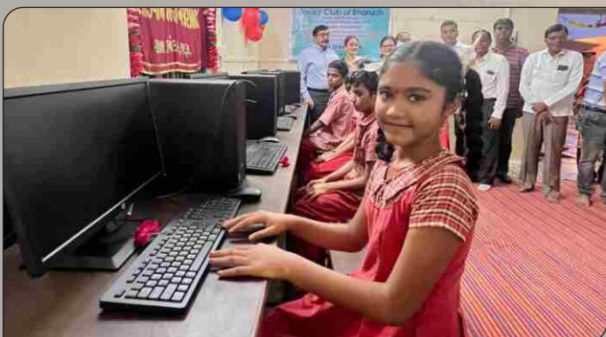
Dandiya Bazar Mishra Shala