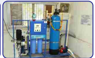
Clean Drinking Water