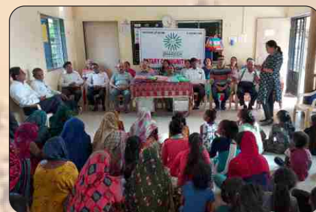
Dress and Sadi Vitaran at Umraj