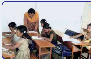
Hum Honge Kamyab - Literacy