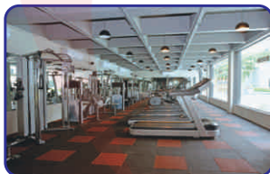
M. I. Patel Rotary Youth Center