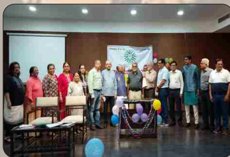
Charter Day Celebration