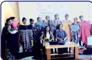
Women Empowerment Project