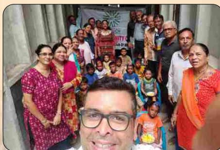
Sabugadh Aganvadi Nasta Vitaran