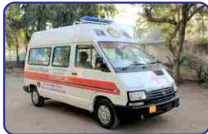
Ambulance & Morgue Vehicle