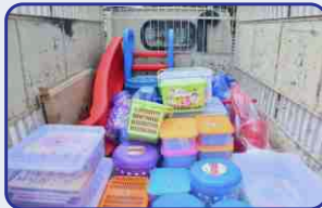
Mobile Toy Library - Ramakdu