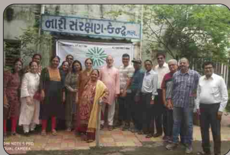
Dress Vitaran at Nari Sanrakshan Kendra