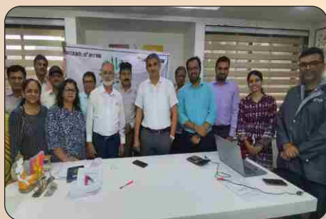
Charter Accountant Day Celebration