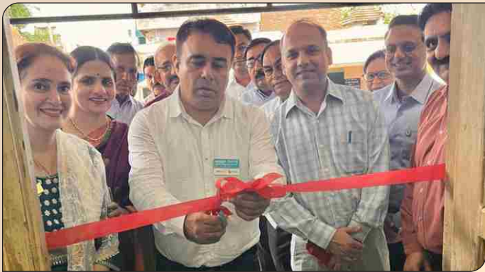
Vejalpur Mishra Shala