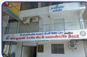
P.D. Shroff Rotary Diagnostic Center