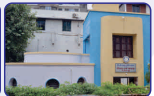
Pay & Use Toilet Blocks